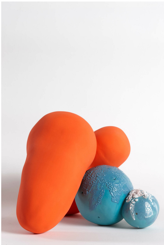
Orange, ca. 2022.

It's quite funny actually. Where I live, so many people pass me by in my day and ask me about the clay and so on, so I started offering workshops for a few ladies. After this, I received a lot more requests! Many ladies want to try it and learn how they can make their own ceramics. Now, every week, I have four classes. For them, it's therapy. Some people go to a spa. Some people like to travel. They—and I—like to work with the clay. This is a need in every person, no matter where they come from or what their situation is.