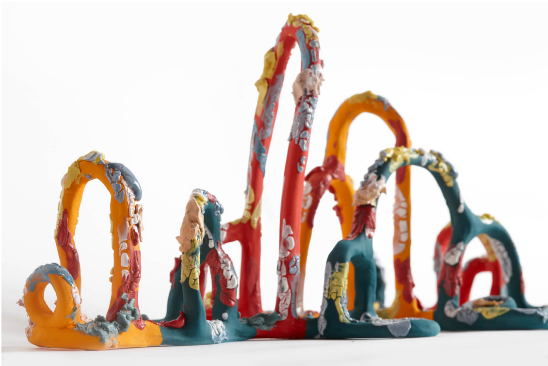
Spectrum, ca. 2022.

I like organic forms especially but, with each piece, I wanted to introduce a new color on it, but I'm minimalist—I wanted to keep the piece as it, with the new color coming from somewhere else. I wanted rounded shapes and something going out from the rounded shape. This is why I created extra volume on each piece and—on this extra volume—I added my new colors.