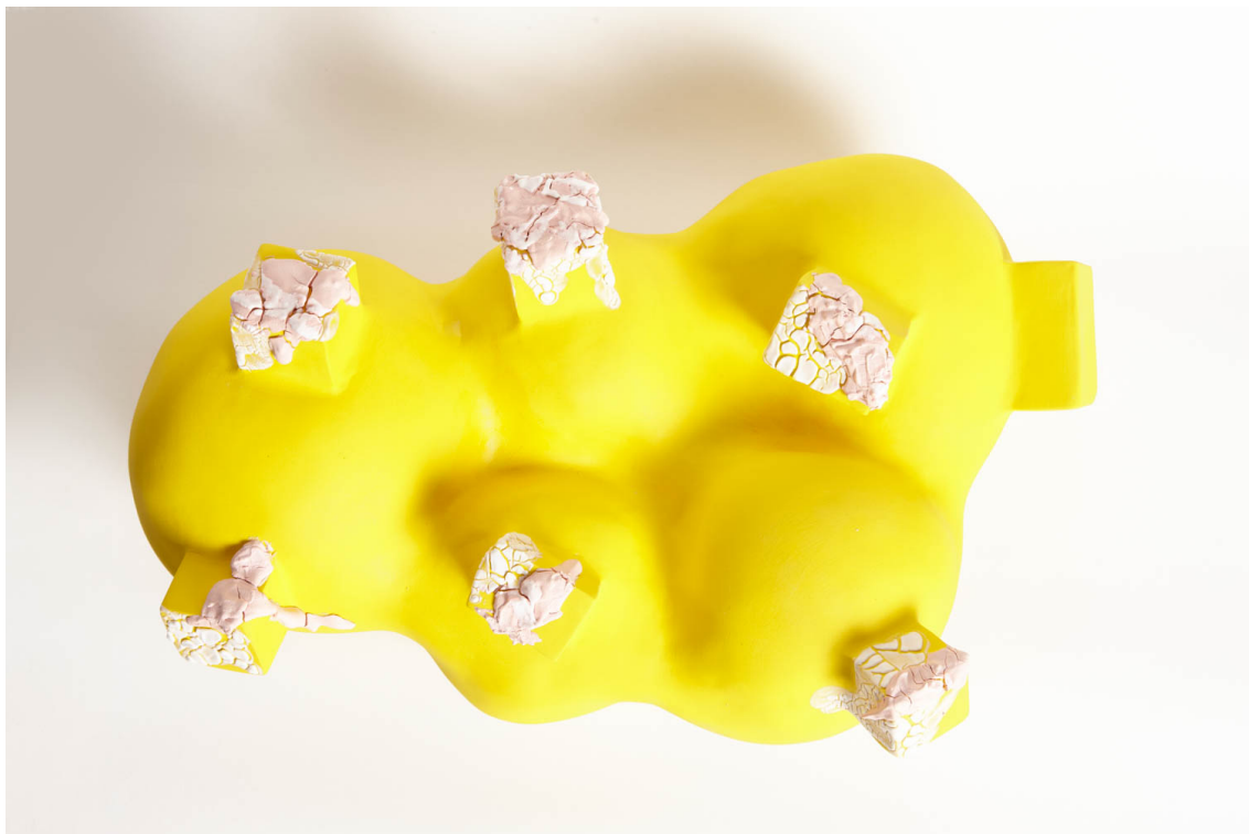
Yellow, ca. 2022.

I don't like it when they say that an artist should be always like the same thing—to have to continue on this one path. I don't think so. I think art is found in evolution, so I need to experiment with many forms. I don't want to stop myself by sticking to this or that design – I feel that I'm always discovering.