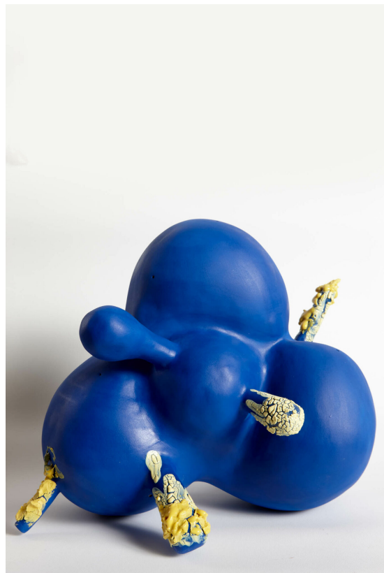
Blue, ca. 2022.