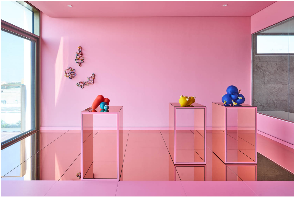
Roufael's works on display at the Art of Living.